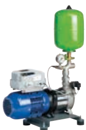
KSB Delta Compact Single-pump system