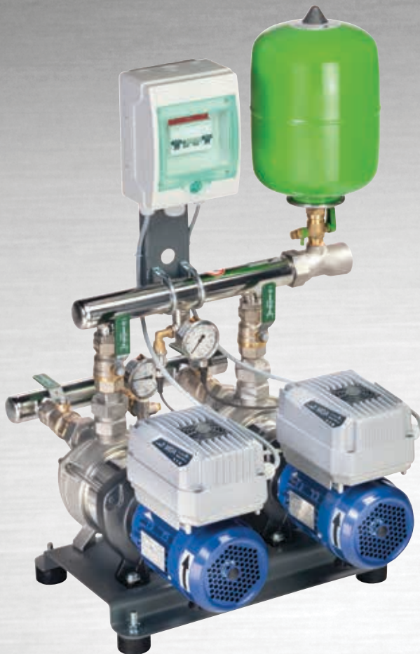
KSB Delta Compact two-pump system