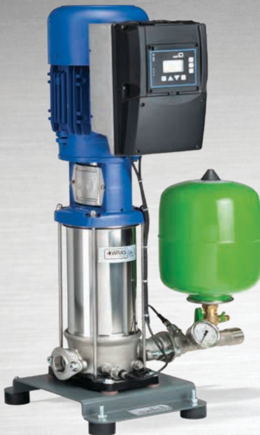
KSB Delta Solo SVP