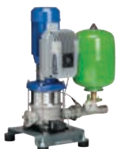
KSB Delta Solo MVP