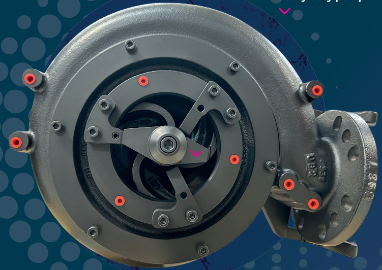
Image shows the robust heavy duty pump